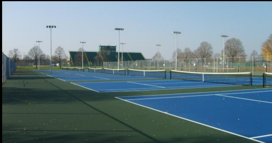
USTA Tennis Courts