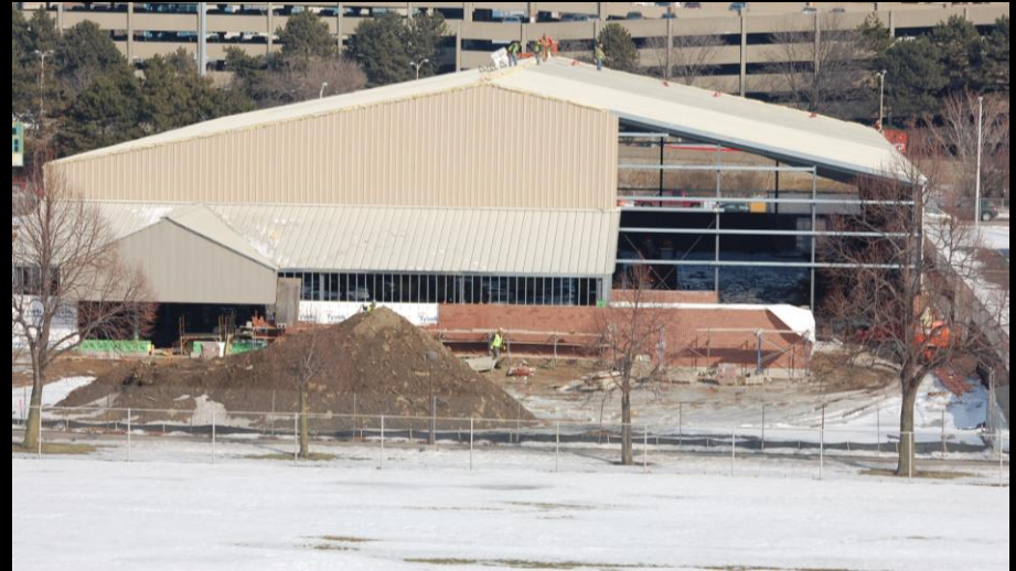
East Elevation of Multipurpose Building