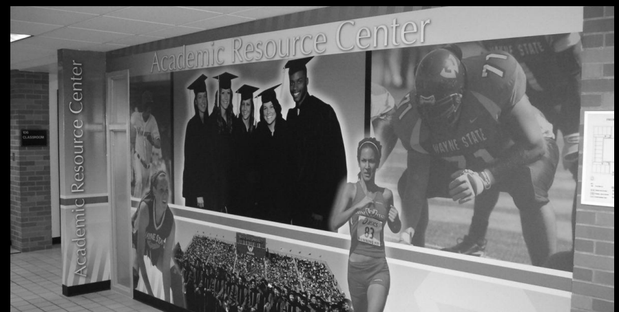
Academic Resource Center