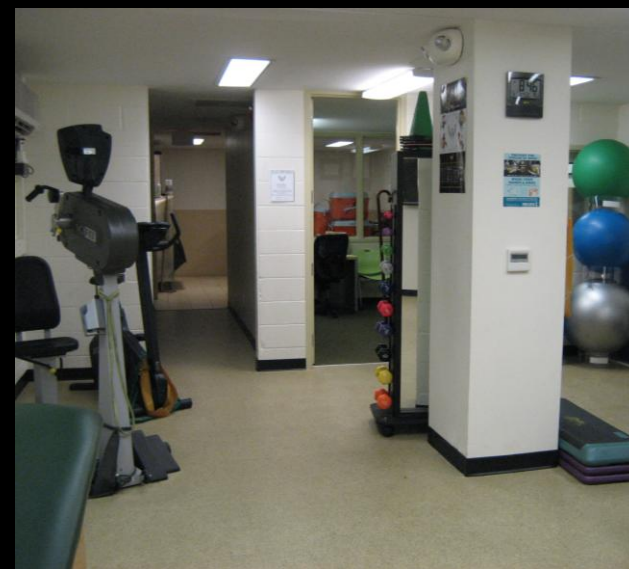
Renovated Training Room