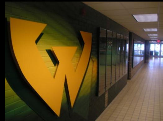
Academic Recognition Display