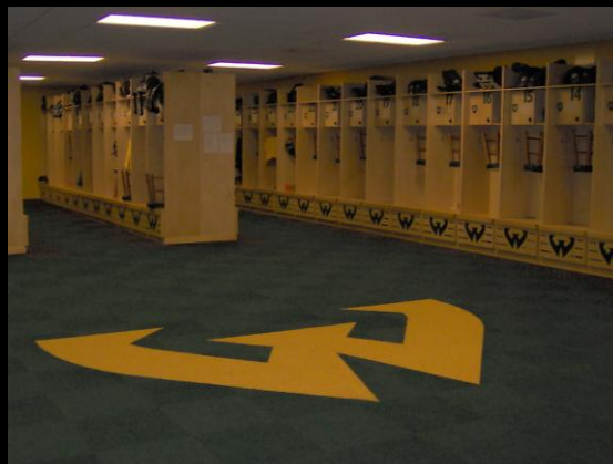
Football Locker Room